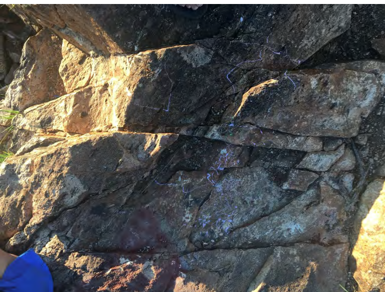
Next to the desk