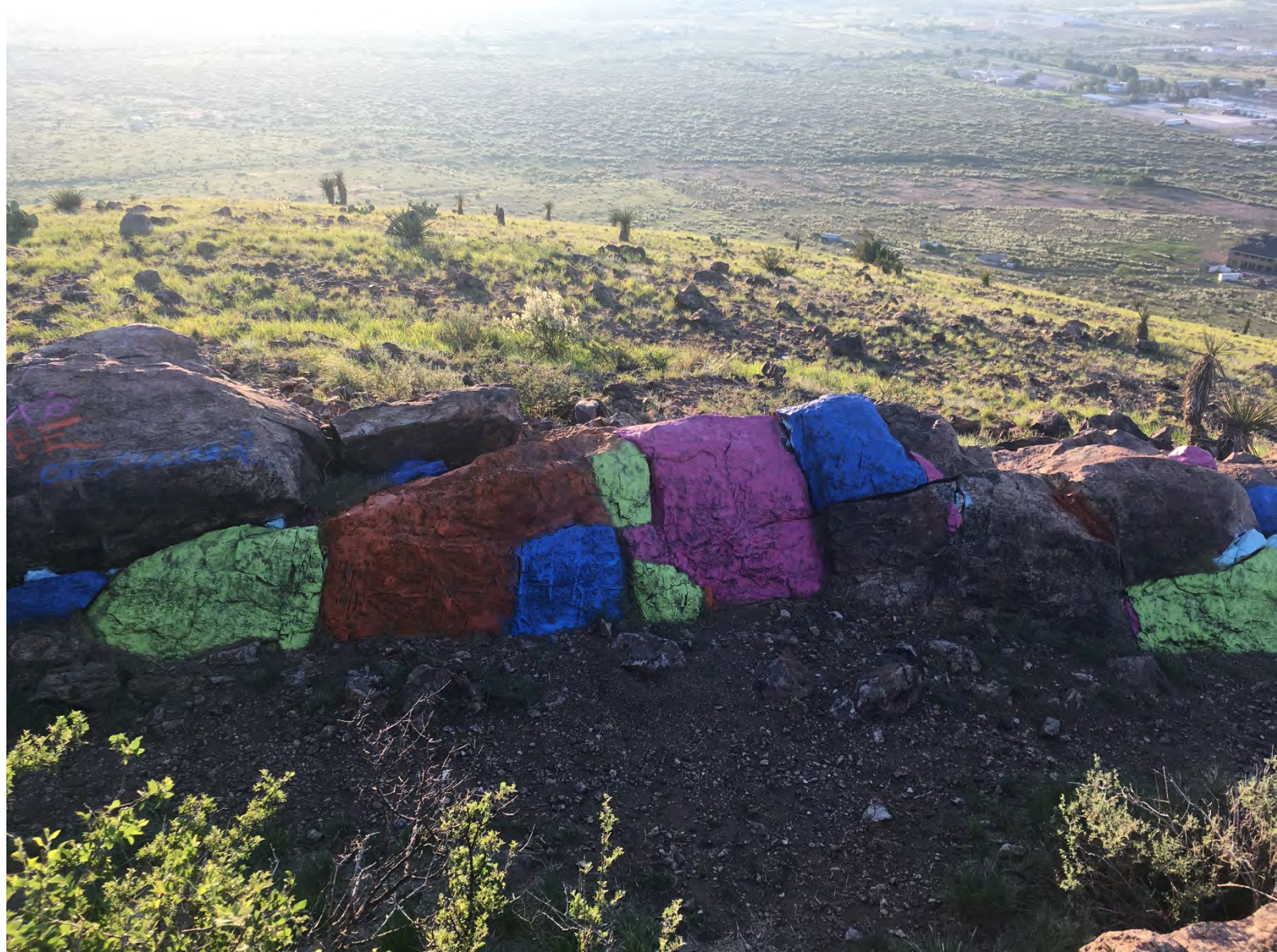
~40 feet south of the desk