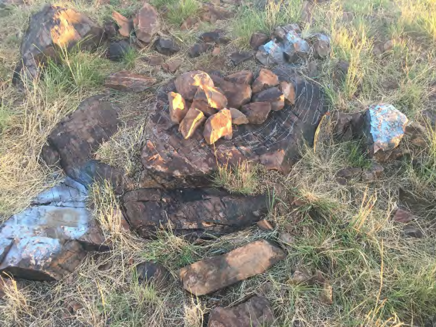
Near Rockpile above Mtnside dorm