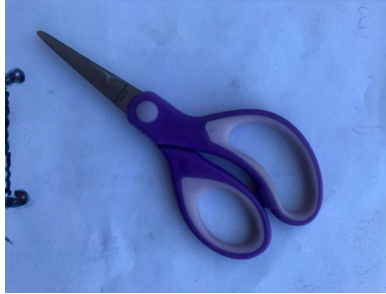
While the light is poor, this image can be easily cropped, and color corrected in Photoshop