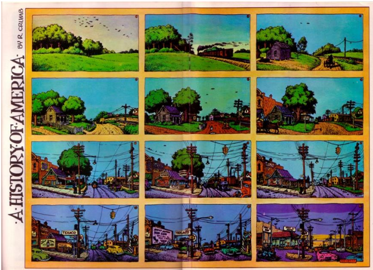
Crumb, R. "A History of America." 1979