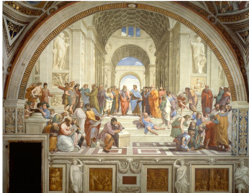
"The School of Athens" by Rafael