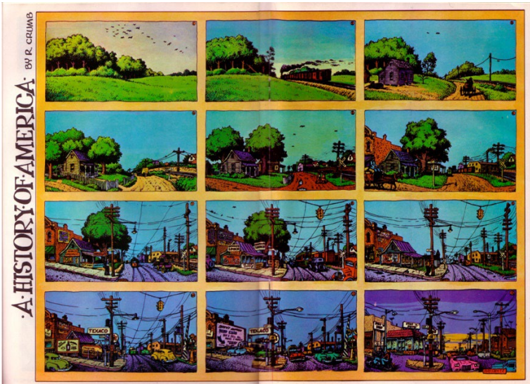
Crumb, R. "A History of America." 1979